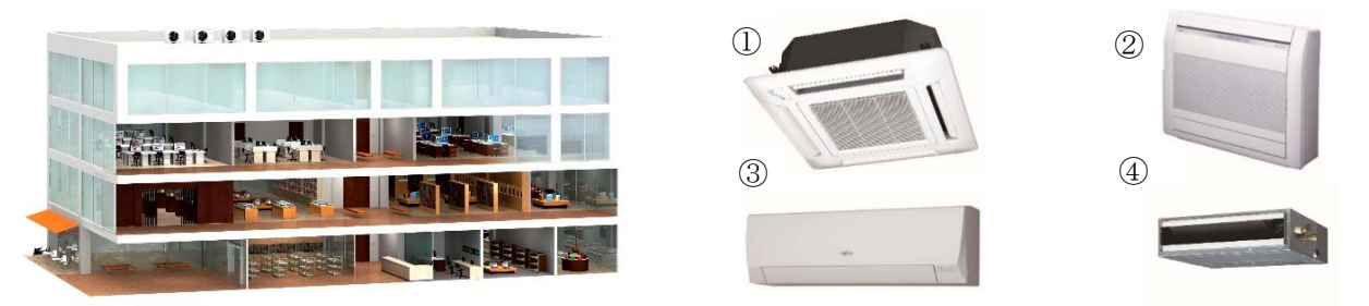
New indoor unit for 1.1kW ① Ceiling ② Floor ③ Wall mounted ④ Duct